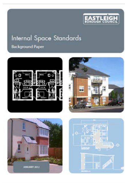
The 2012 Internal Space Standards background paper for the 2011-2029 Eastleigh Borough Council Local Plan