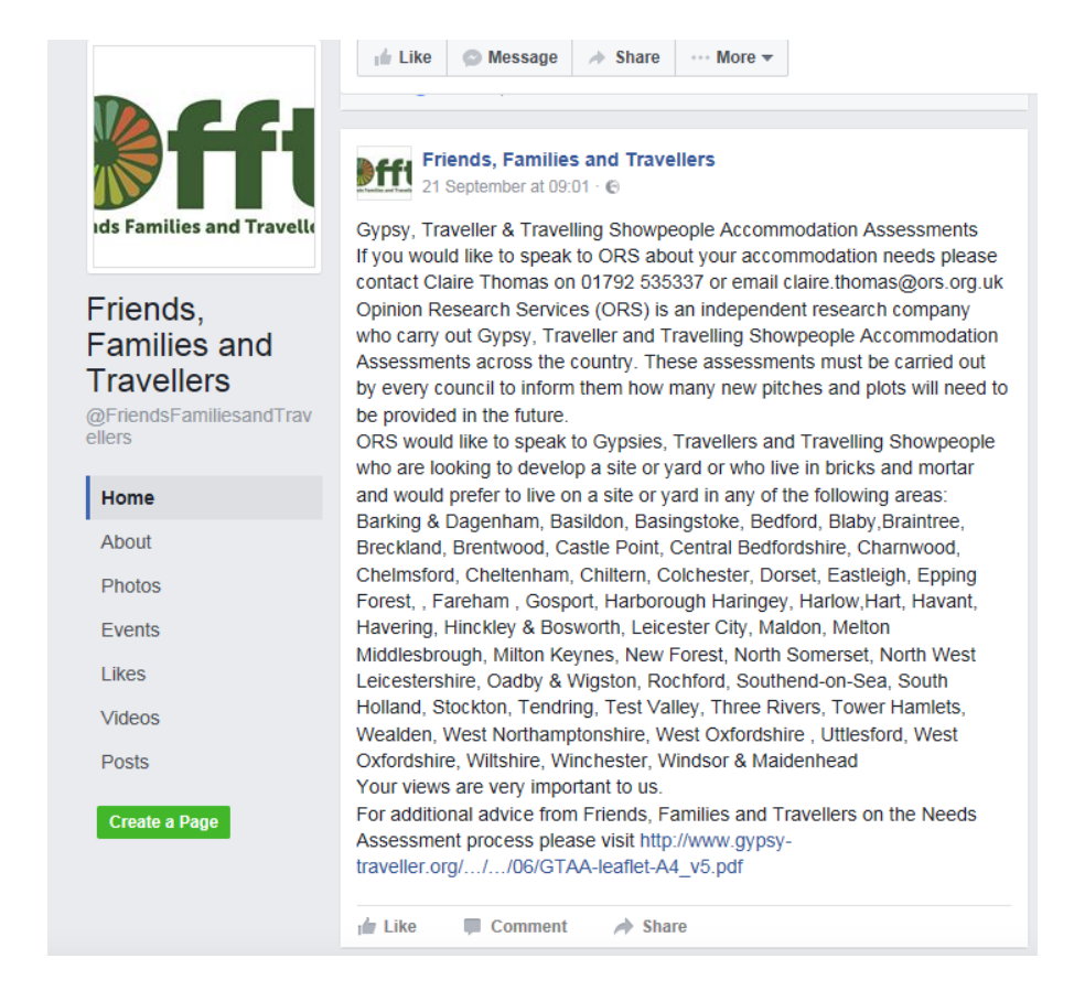
Figure 6 - Bricks and Mortar Advert

In addition adverts were places on social media (including the Friends Families and Travellers Facebook group). An example is shown below. Through this approach we endeavoured to do everything within our means to give households living in bricks and mortar the opportunity to make their views known to us.