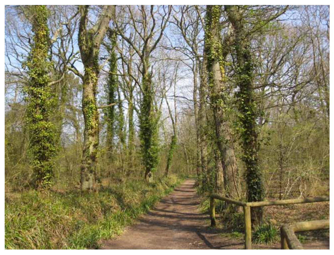
Figure 31. Manor Farm Country Park