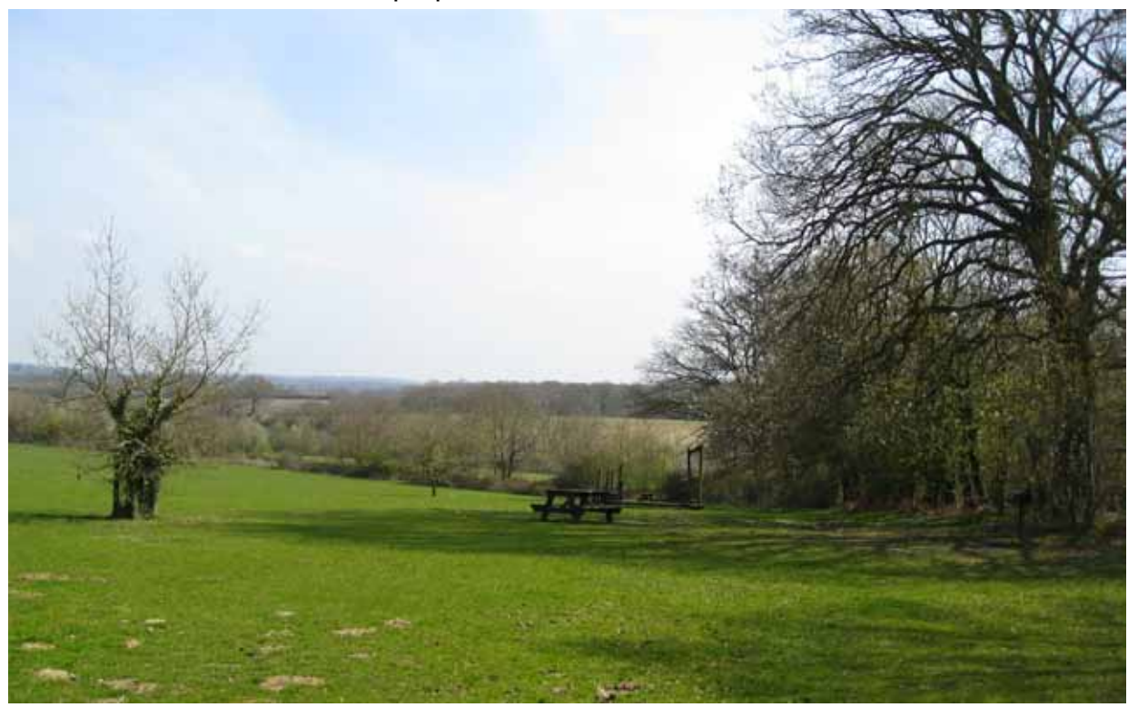
Figure 32. Looking across to Dock Copse