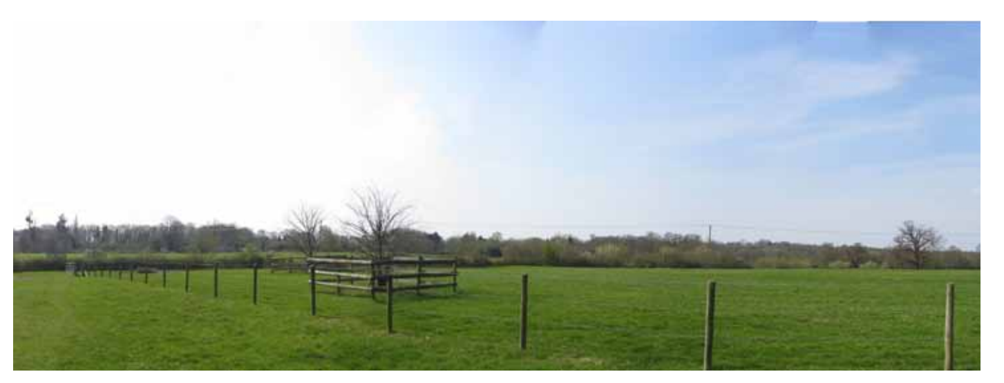
Figure 17. Panorama view across Stoneham Park