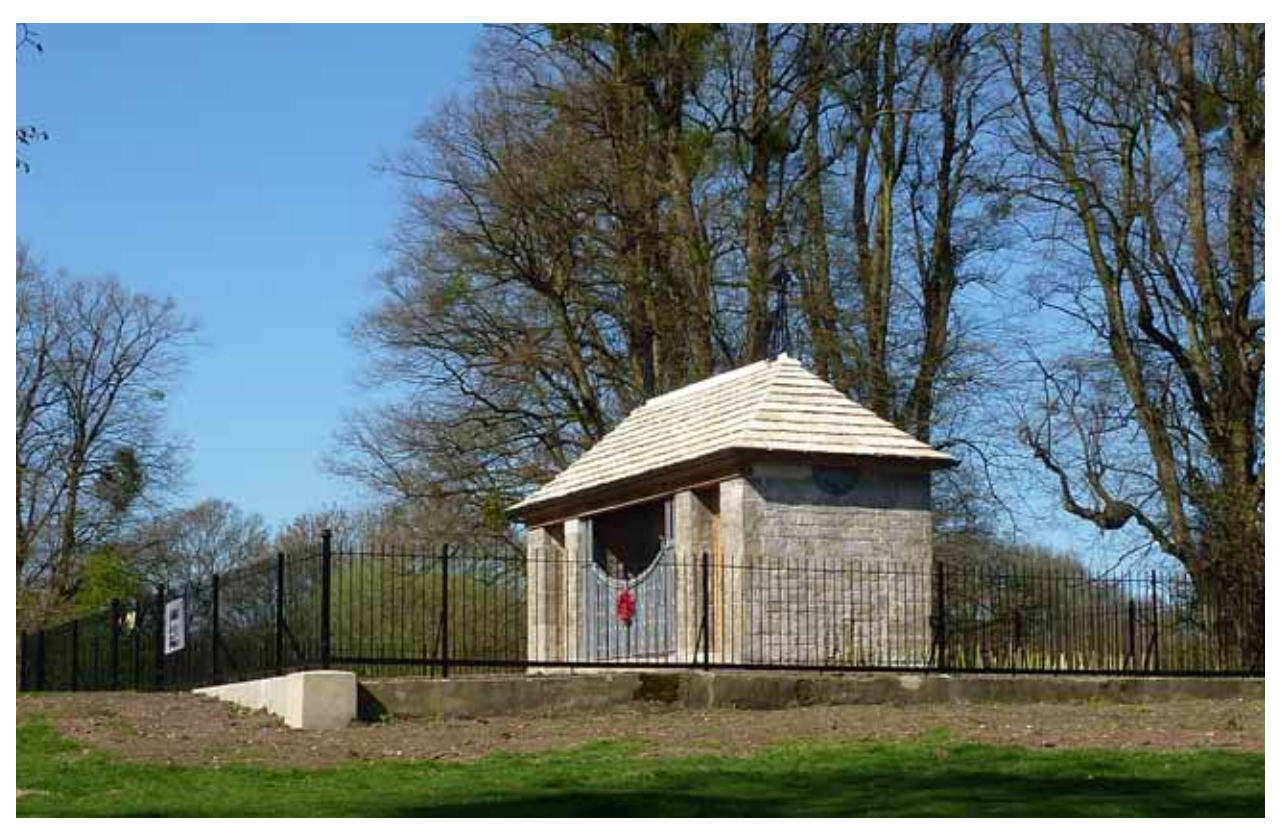
Figure 16. The Shrine in Stoneham Park wooded and enclosed. The Shrine has recently undergone restoration work.

4.86 There are 3 listed buildings in this character area, located on Stoneham Lane, which would have originally been associated with the North Stoneham estate. The Old Rectory is located in the southeast corner of the character area. The building and grounds form a distinct and contrasting element to the rest of the character area. The grounds, which include the gateway entrance that is listed separately, form an enclosed site that has been partially developed to provide office space and