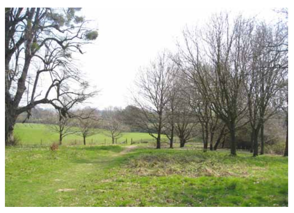
Figure 14. View along historic avenue of trees in Stoneham Park