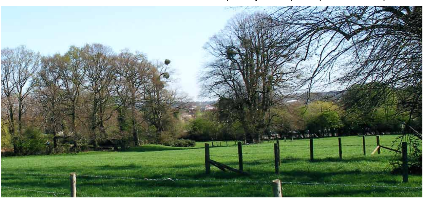
Figure 15. View north east across Stoneham Park panorama

4.86 There are 3 listed buildings in this character area, located on Stoneham Lane, which would have originally been associated with the North Stoneham estate. The Old Rectory is located in the southeast corner of the character area. The building and grounds form a distinct and contrasting element to the rest of the character area. The grounds, which include the gateway entrance that is listed separately, form an enclosed site that has been partially developed to provide office space and