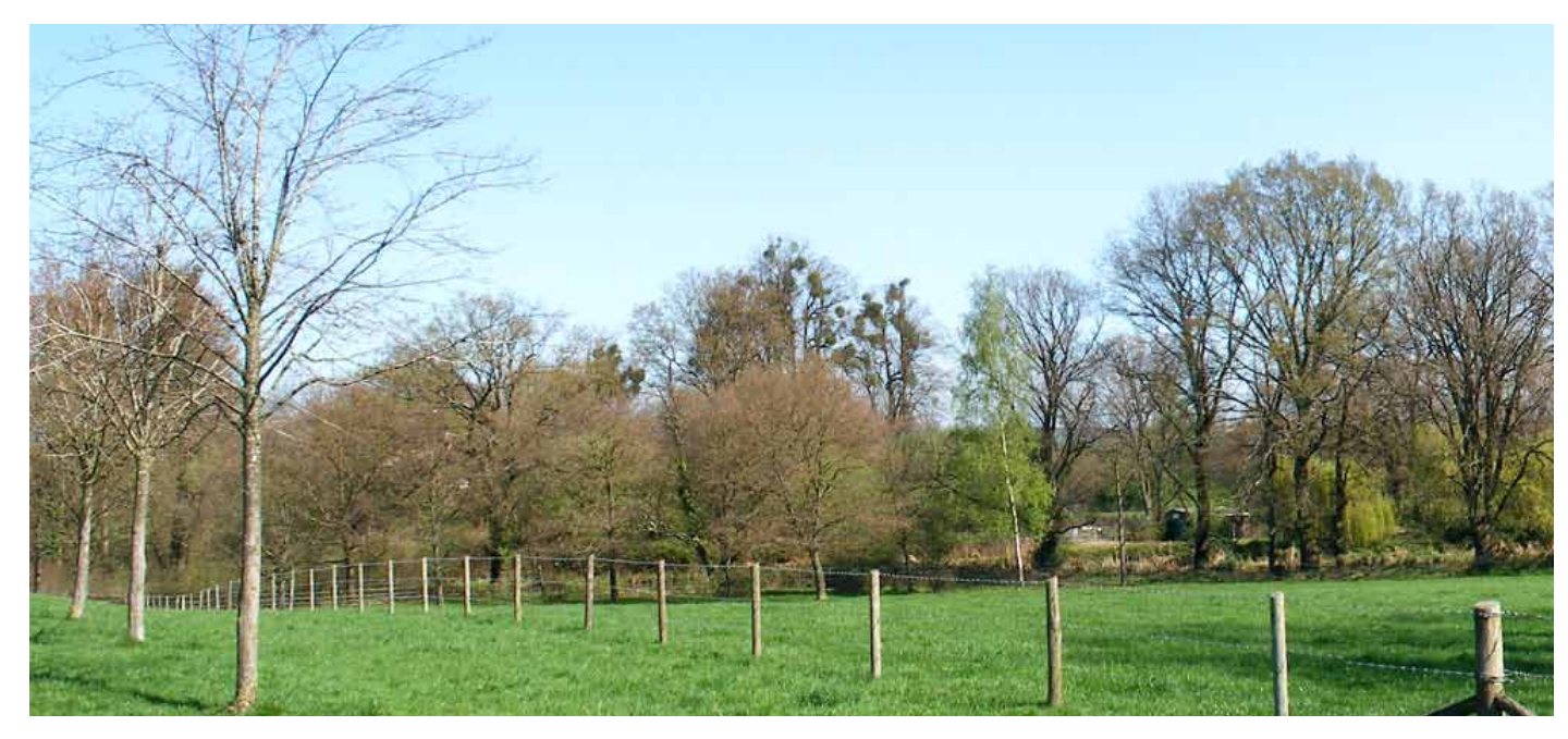
Figure 15. View north east across Stoneham Park panorama