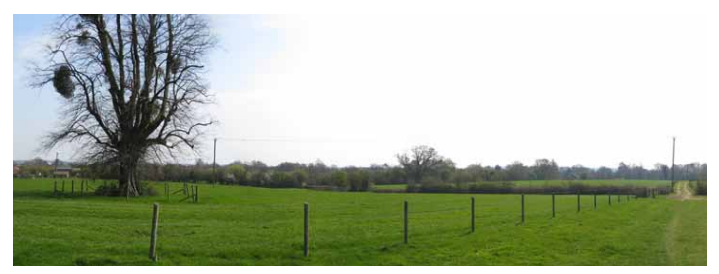
Figure 17. Panorama view across Stoneham Park