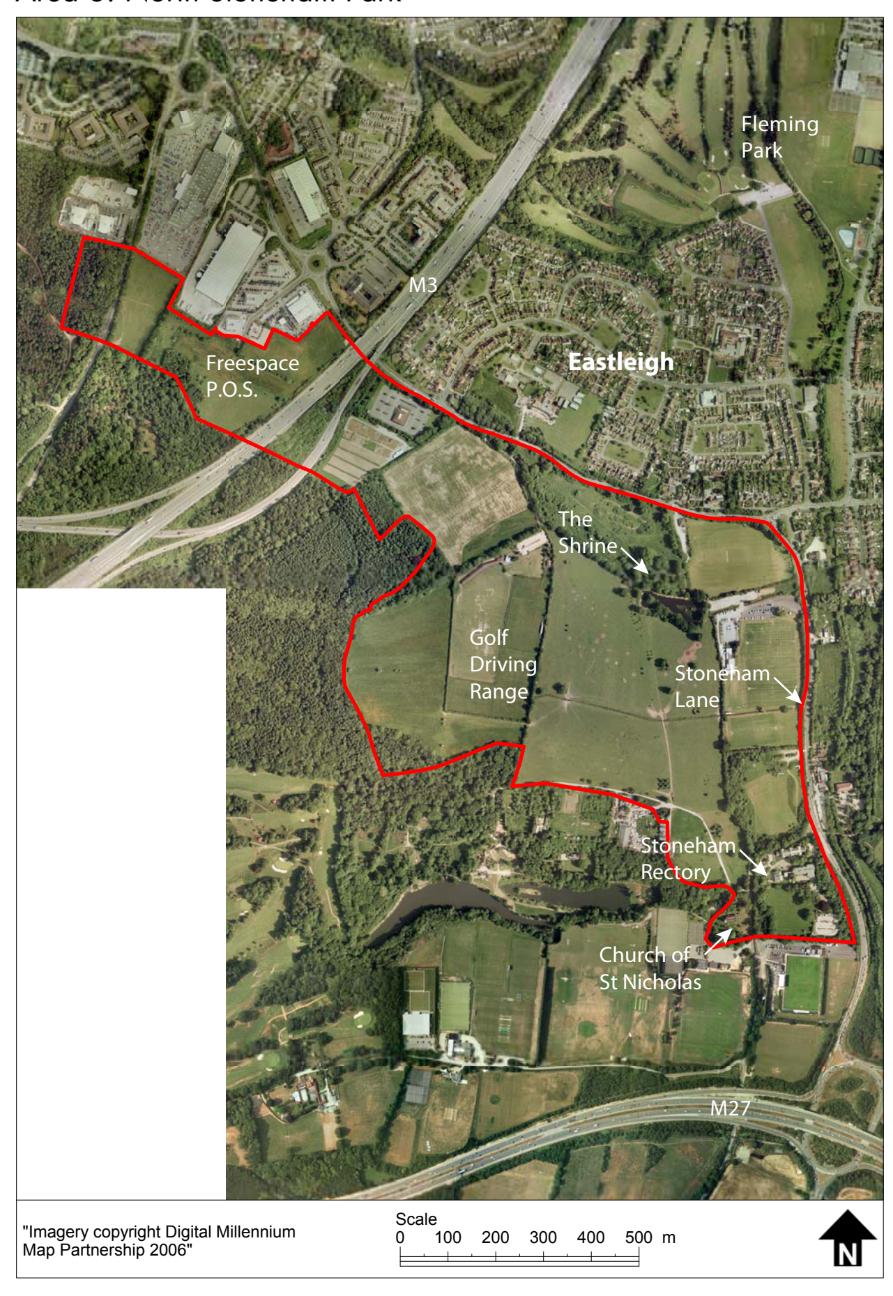
Area 6: North Stoneham Park