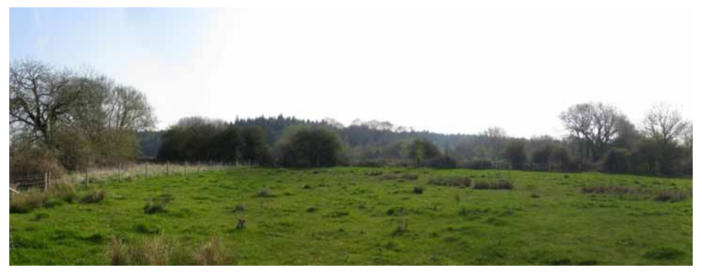
Figure 6. View at the southern end of the Itchen Valley Country Park across the former watermeadows

4.49 This area has distinctive rural qualities despite the peripheral detractors of Southampton Airport, the railway and the M27 motorway.