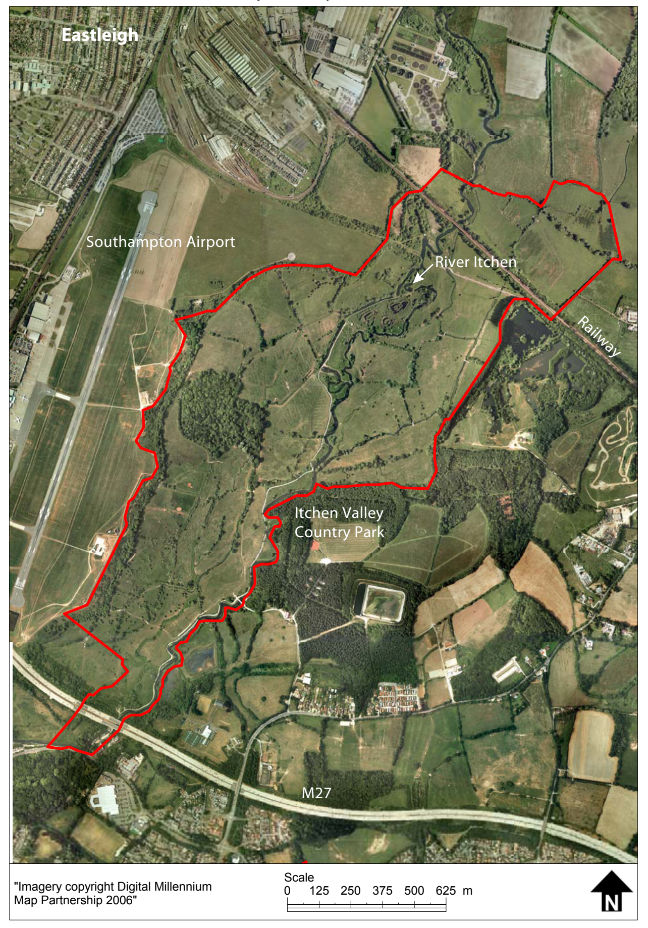
Area 3: Lower Itchen Valley Floodplain