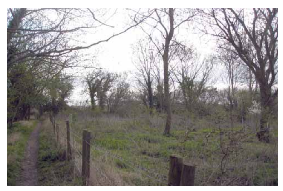
Figure 7. The Itchen Navigational Trail