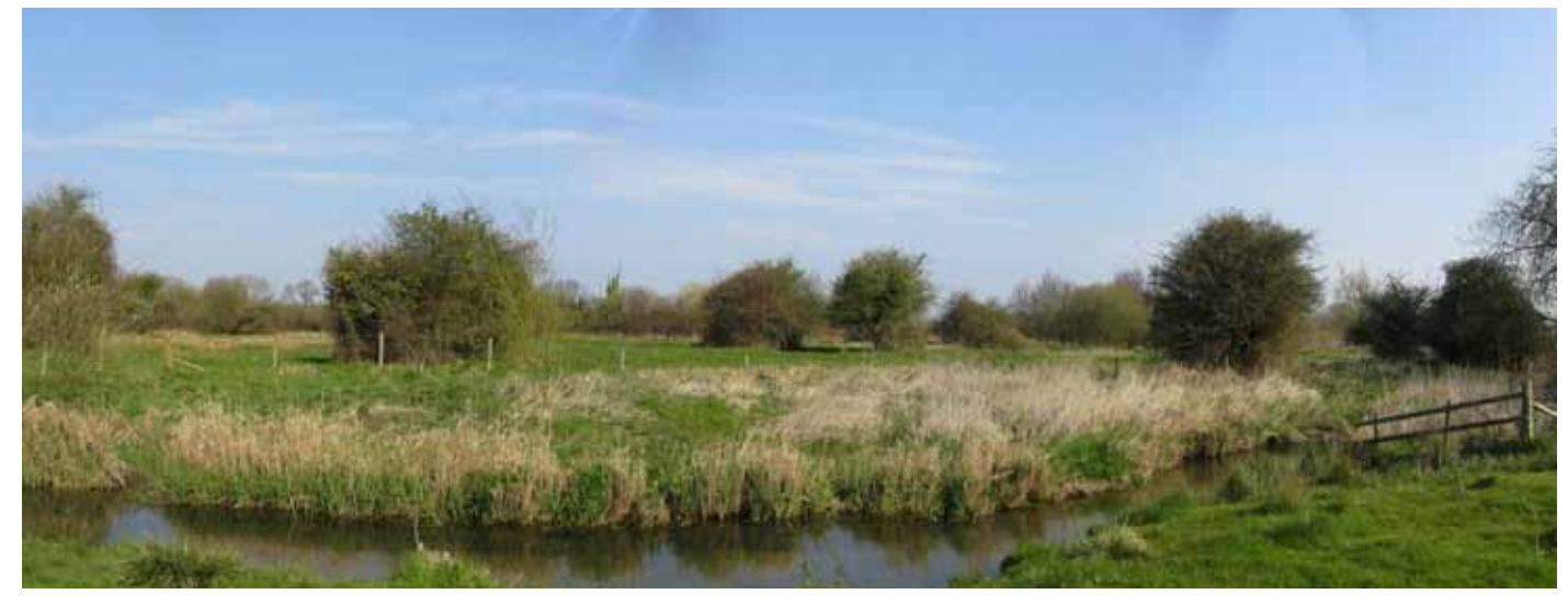
Figure 6. View at the southern end of the Itchen Valley Country Park across the former watermeadows