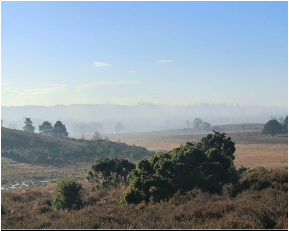
The New Forest Landscape