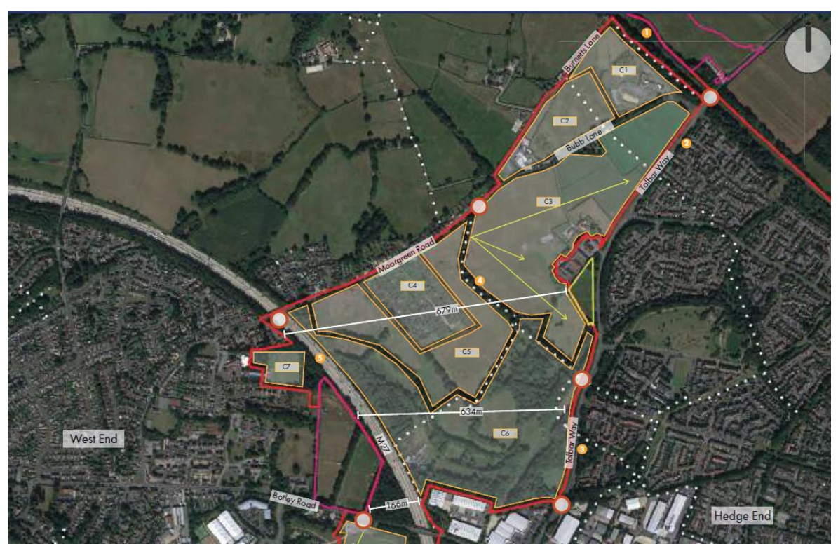
Image EDP1: Figure C3 Reproduced from EBC's Settlement Gap Study 2020 (please note, the measurement of 679m indicated above measures closer to 850m).