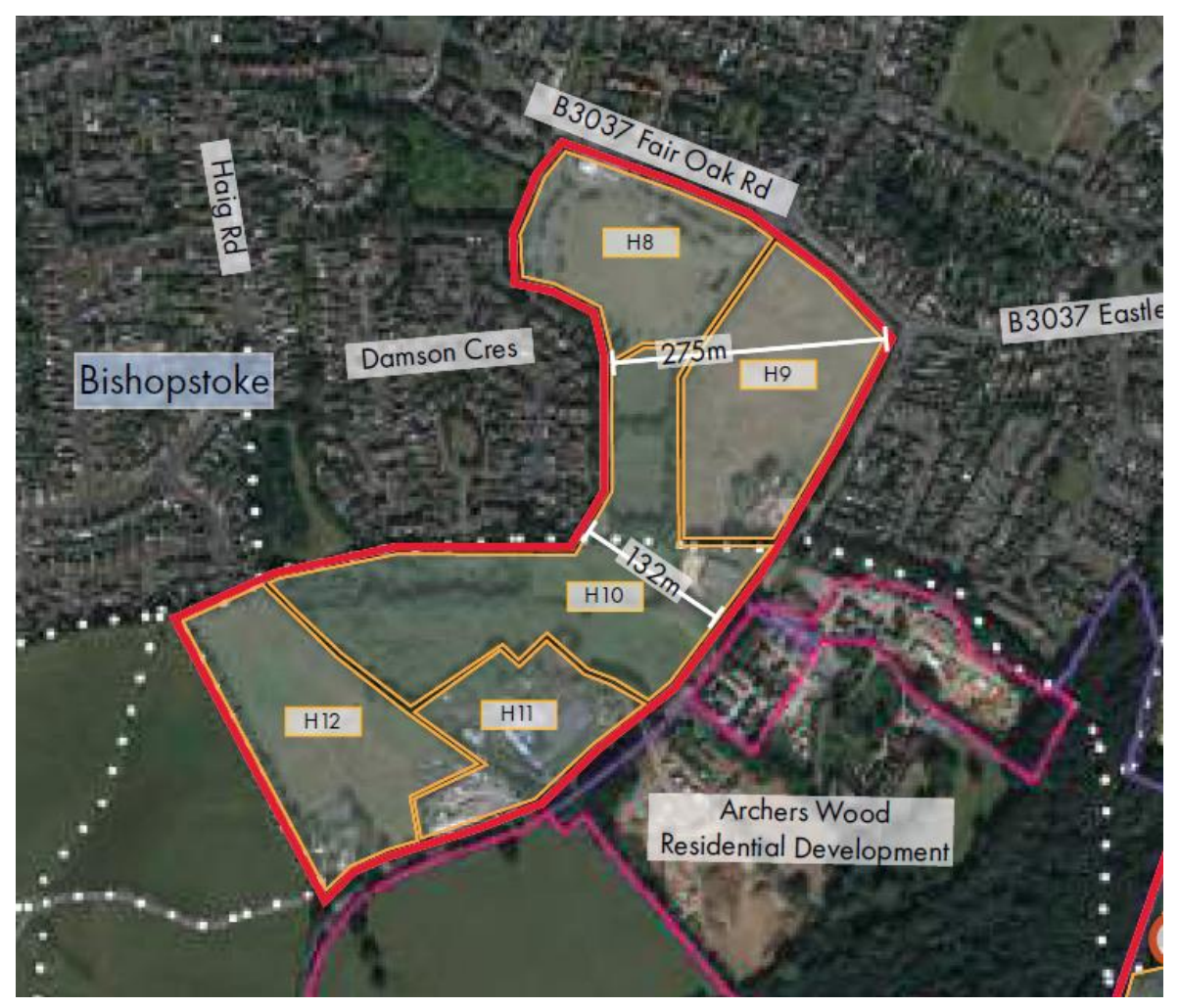
Image EDP 4: Gap of 132m within Horton Heath, Fair Oak, Bishopstoke Gap.