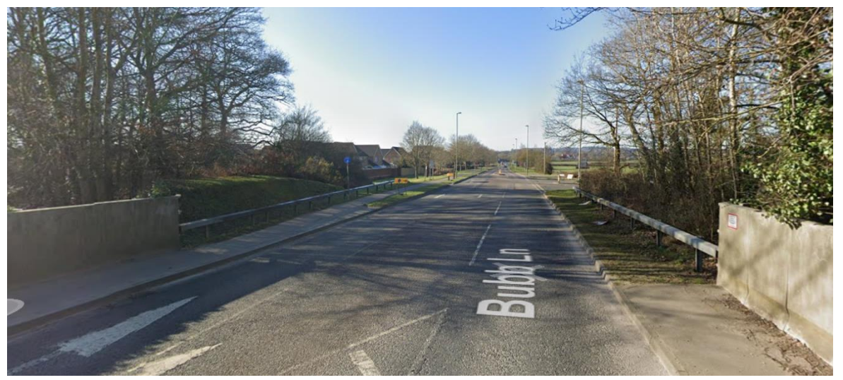
Image EDP 2 : Arrival Point at Hedge End from Horton Heath, indicated by signage, character of the road and built form. (Source: Google Maps July 2021).