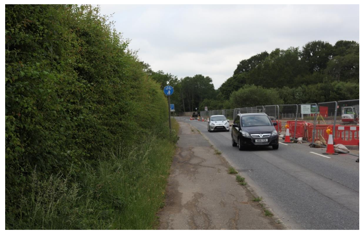
Image EDP 3 : Access point to One Horton Heath public open space, separation from Hedge End is provided by mature vegetation which lines the Railway Embankment.