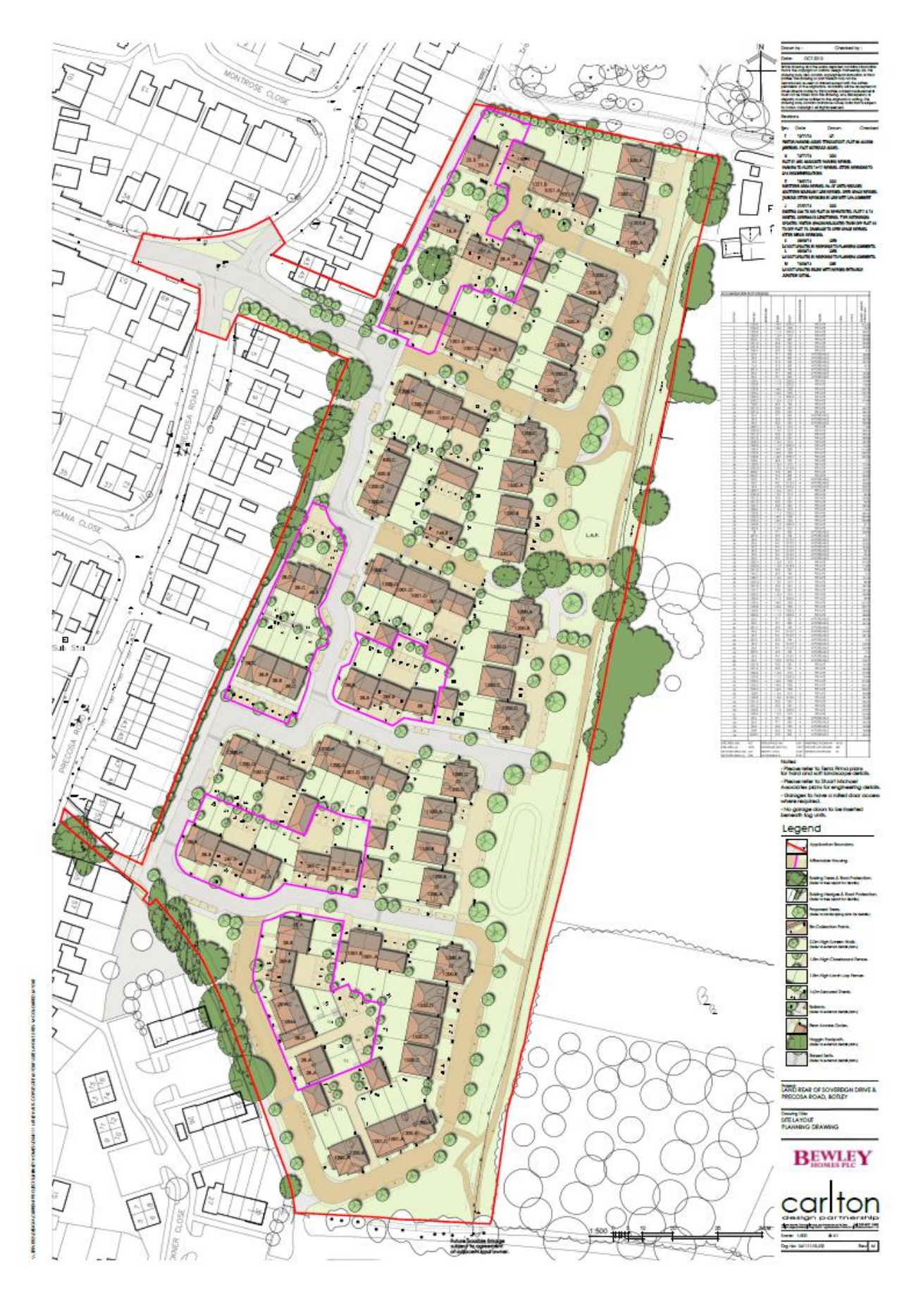
Figure 2.1 | Proposed Site Layout Plan of the Previously Allowed Scheme