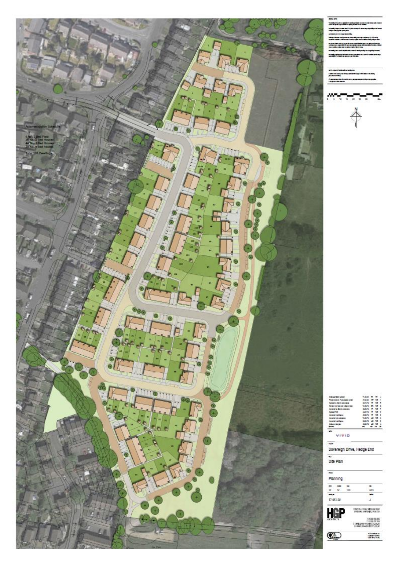
Figure 2.2 | Proposed Site Layout Plan of the Appeal Proposal