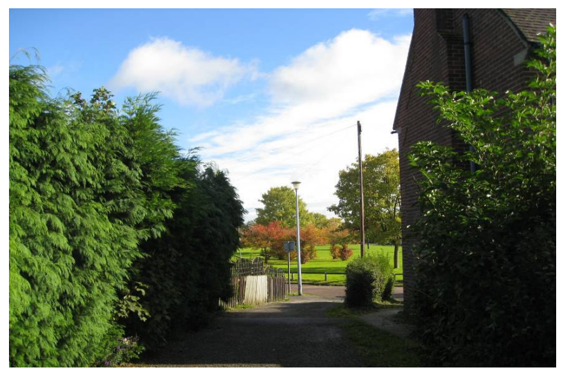
Site entrance, No.41 to right