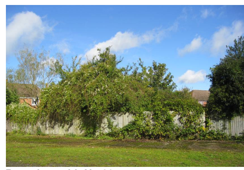
Boundary with No.39