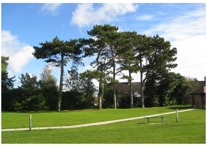
View from Recreation Ground, rear of No. 41