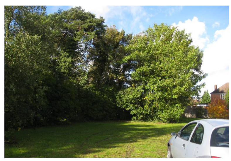
Western corner of site