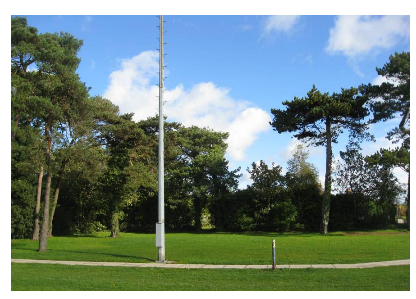
View to site from Recreation Ground