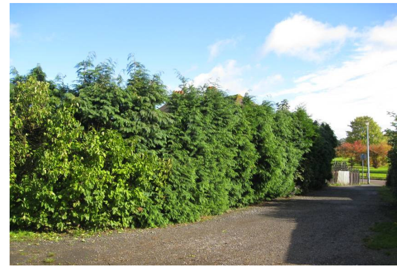
Site entrance, existing boundary with No.40