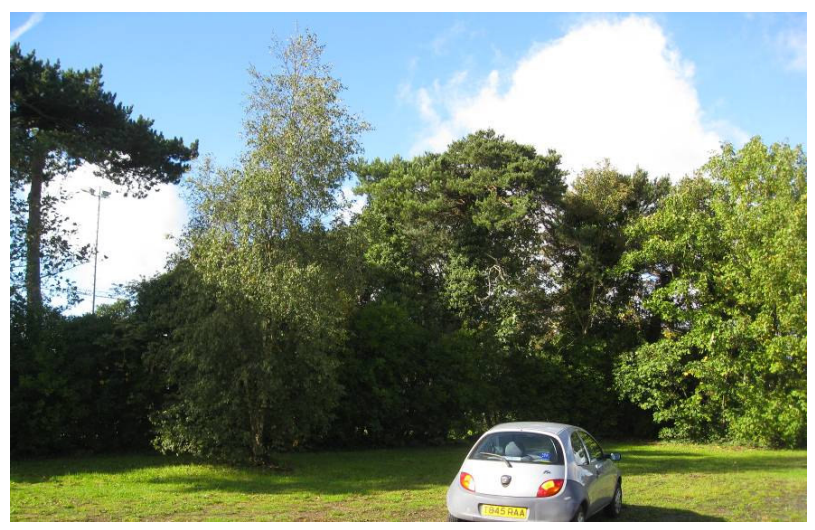
South west boundary