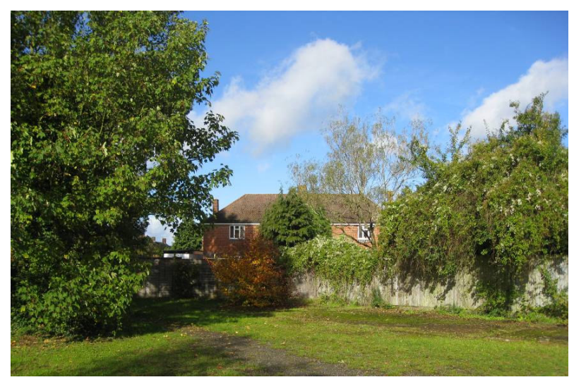
Boundary with No.28 Queensview