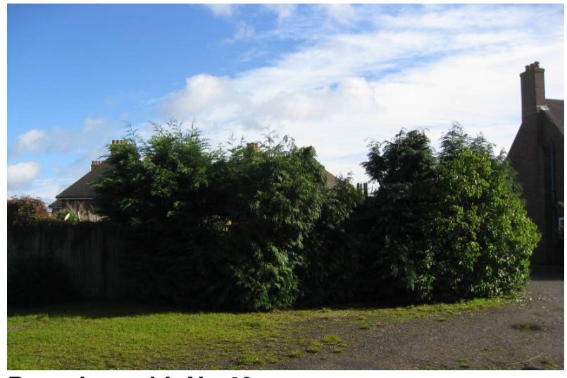
Boundary with No.40