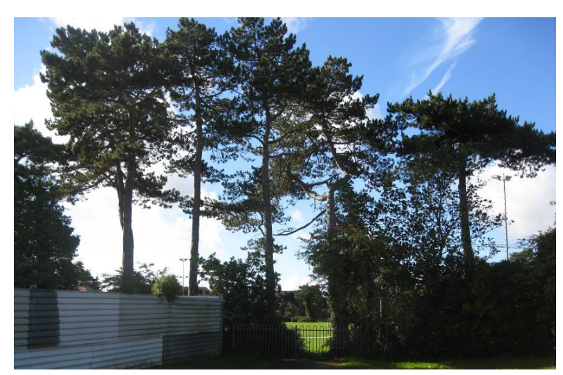
View into recreation ground